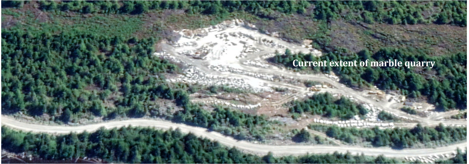
Current extent of marble quarry